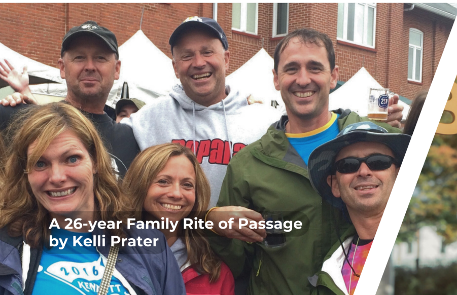
A 26-year Family Rite of Passage by Kelli Prater