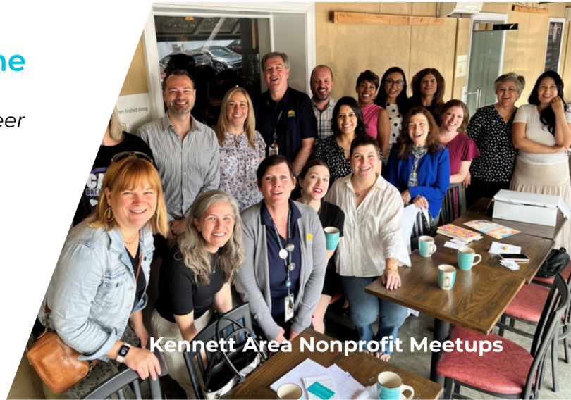
Kennett Area Nonprofit Meetups

Borough of Kennett Square Casa Guanajuato Chester County's Brandywine Valley Clover Market Four Seasons Garden Club Longwood Gardens Kennett Area Community Services Kennett Area Restaurant & Merchant Association Kennett Library Kennett Township Spade & Trowel Club Square Roots Collective United Way of Southern Chester County