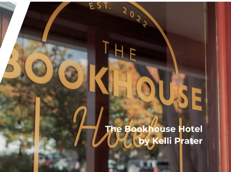
The Bookhouse Hotel by Kelli Prater