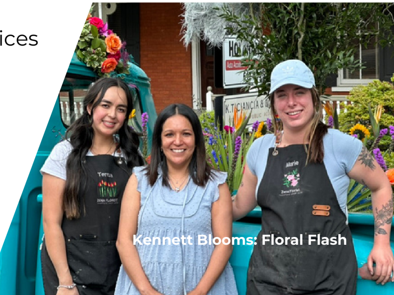
Kennett Blooms: Floral Flash