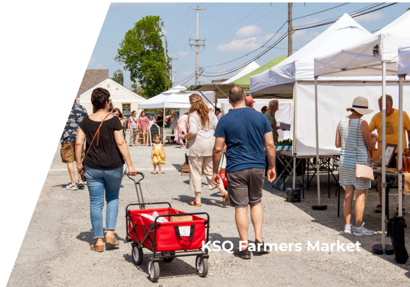
KSQ Farmers Market